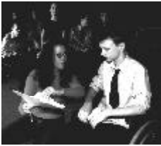
King's Head Outreach: drama for all.