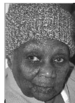
Day centres: a crucial service for old people.