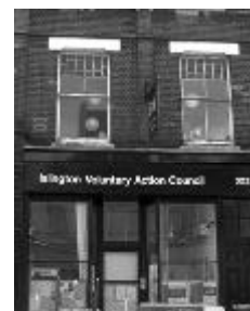
IVAC: same building, new paint.

UNFORTUNATELY last year's plans to move office, developed with the Ethical Property Company, did not come to fruition. This was largely due to the last minute failure of a development planned with Islington Council. However, we hope to revive the project this year and move towards new, more appropriate premises. The issue is pressing because we now employ fourteen staff, with one more on the way: the building is full! In the meantime, we have taken the opportunity to improve our environment and upgrade our exterior with internal and external redecoration.