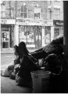
Islington Law Centre: refurbished this year.