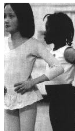
Best foot forward at Islington Arts Factory.