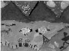
The mountains of home: by an Afghan child at Children's Express.